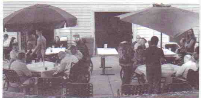
Board of Directors/Residents Cookout.