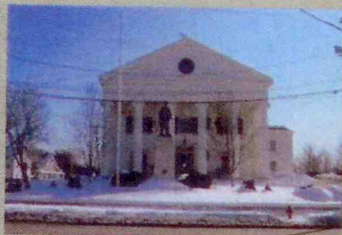
Randolph: Stetson Hall

The Community Preservation Coalition recognizes the hard work and commitment of these nine communities, who submitted outstanding projects for consideration for the Robert Kuehn Community Preservation Award.