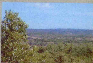
Sudbury: Nobscot Scout Reservation