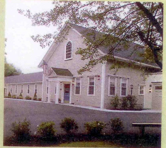
LARGE CATEGORY WINNER: LEXINGTON - DOUGLAS HOUSE Lexington's Douglas House provides 15 affordable housing units for survivors of serious brain injuries. This project meets three CPA purposes: historic preservation, affordable housing and recreation. The proximity of Lexington's downtown area, its public transportation, its cultural amenities and the prospect of local jobs made this former home of the Lexington Press an ideal location for this project.

The Community Preservation Coalition recognizes the hard work and commitment of these nine communities, who submitted outstanding projects for consideration for the Robert Kuehn Community Preservation Award.