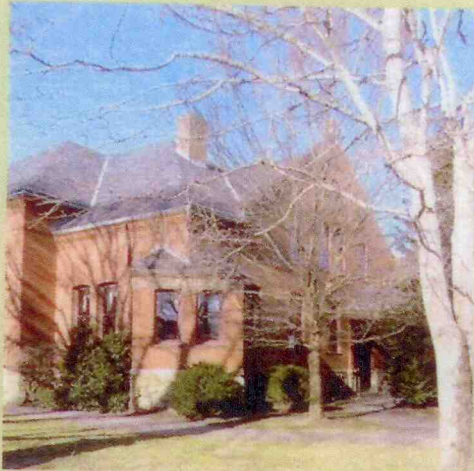
SMALL CATEGORY WINNER: MARION - MARION MUSIC HALL The preservation of the 1891 Music Hall included many needed renovations and restorations: a new heating and cooling system was installed; support walls and columns in the basement repaired and rebuilt; exterior wall was repointed and repaired to eliminated leaking; and original 1891 windows repaired to provide energy efficient windows while maintaining the historical integrity of the building.