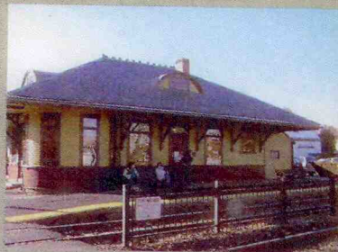
Concord: West Concord Train Depot