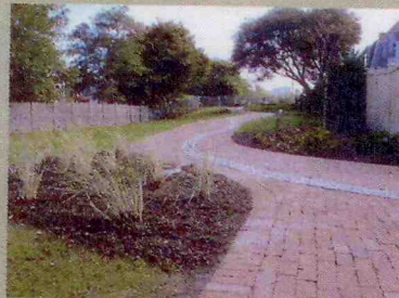
Barnstable: Pleasant Street Park