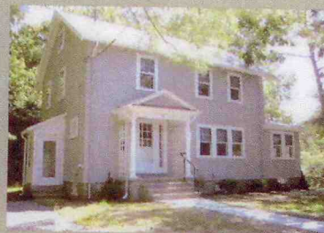
Newton: 76 Webster Park