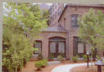
Cambridge: Webster 5 Condominiums