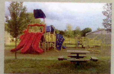
Agawam: School Street Park