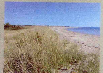
Falmouth: Haddad Property Acquisition