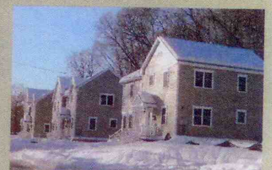
Needham: High Rock Homes